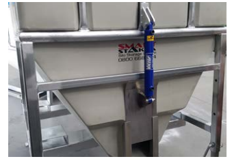
Hydraulic / Pneumatic Ram