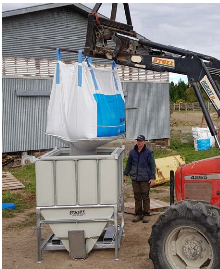
Controlled big bag storage and discharge