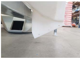
Auger Adaptor Boot