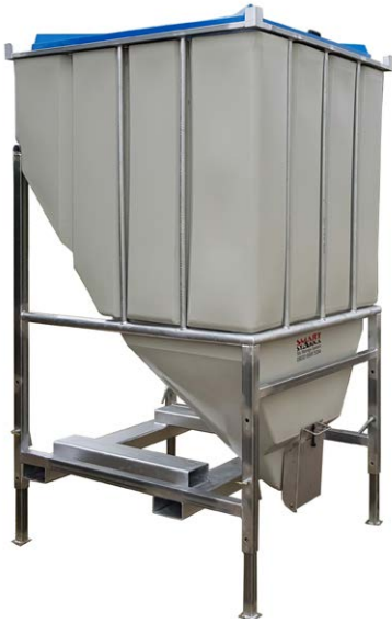
General storage & discharge of dry granular products